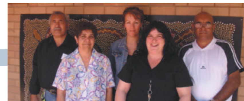
> the 'Millen Street mob'