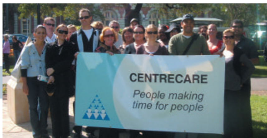
> Domestic Violence March held in April 2007