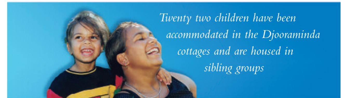
Twenty two children have been accommodated in the Djooraminda cottages and are housed in sibling groups

This program continues to be extremely successful with reunification for three of the children. Sport continues to be a focus for these children with two children receiving a gold and silver medal in the WA Gymnastics championships. Two of the boys showed their skills by securing the school champion and runner up for their age groups.