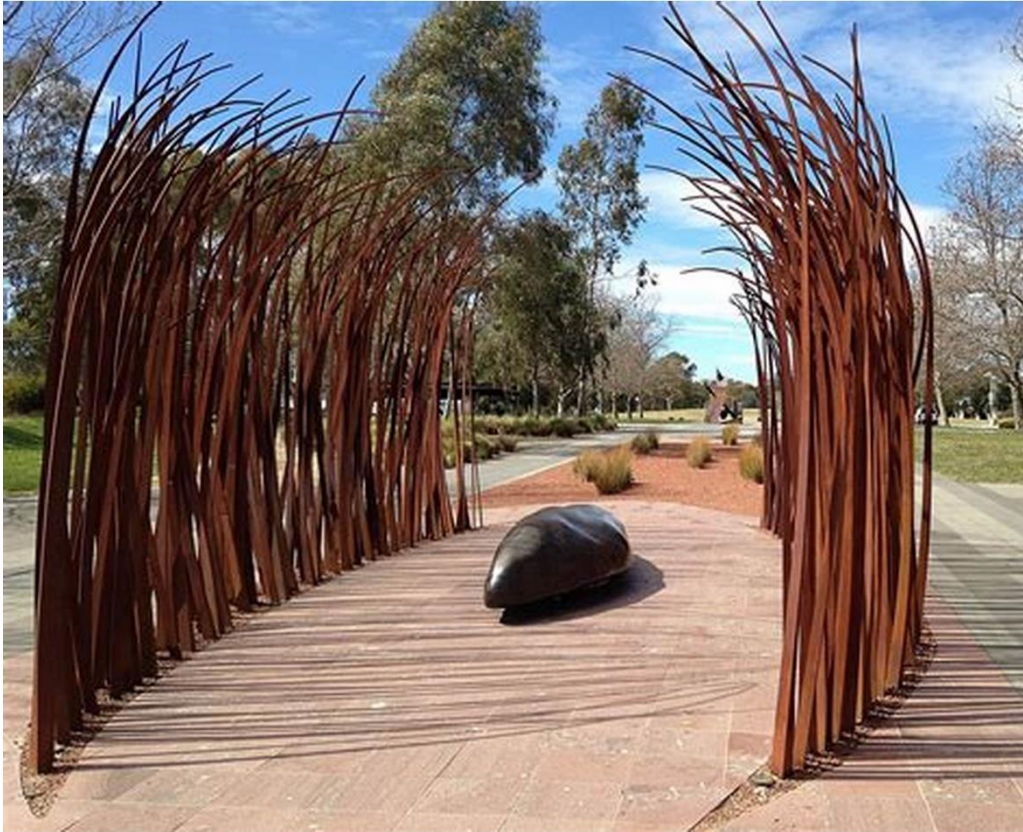
fire and water , Judy Watson

Opened in 2002, Reconciliation Place is a symbol of the Government's ongoing commitment to the reconciliation process. Judy Watson's fire and water (pictured below) is one of 17 artworks that comprises Reconciliation Place, located in the Parliamentary Zone in Canberra. The artwork represents a place to gather, shelter, listen, and share. The curved vertical poles bend 'towards each other in a gesture of Reconciliation, like two hands cupping the distance between them.'