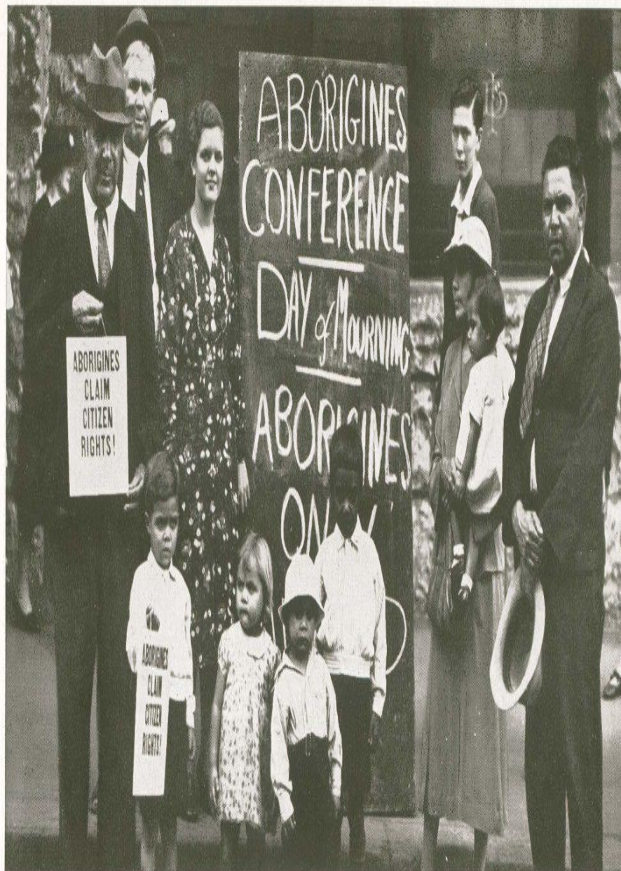
A LARGE BLACKBOARD displayed outside the hall proclaims, "Day of Mourning." Leaflets warned that, "Aborigines and persons of Aboriginal blood only are invited to attend." At 5 o'clock in the afternoon resolution of indignation, protest, was moved, passed.

Address: c/o. Box 1924KK, General Post Office, Sydney.